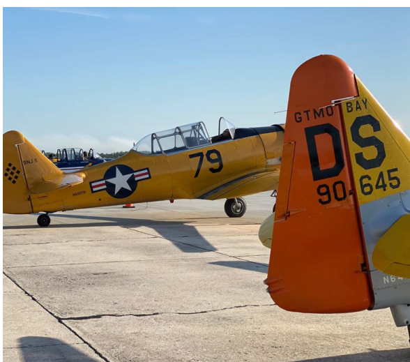
Warbirds for County Flyover

The CRA encompasses the entire airport property and is 2,149 acres. It is believed to be the only airport property that is also its own Redevelopment Agency or similar Special District.