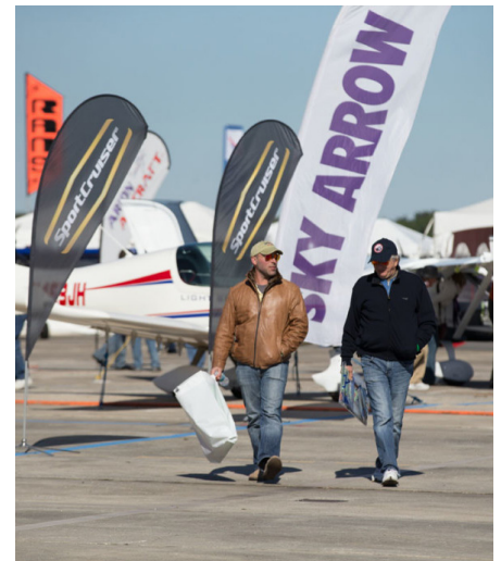
Expo Outdoor Exhibits