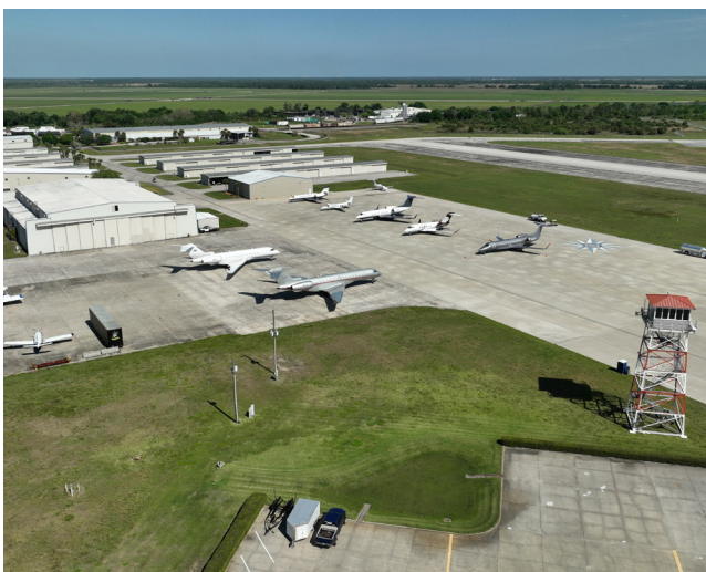
Ramp Activity Race Week

The CRA encompasses the entire airport property and is 2,149 acres. It is believed to be the only airport property that is also its own Redevelopment Agency or similar Special District.