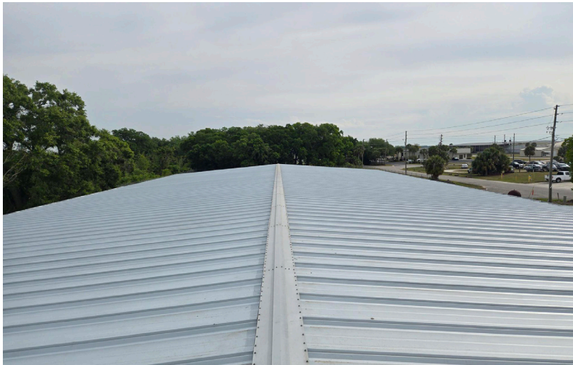
Building 727 Roof Replacement