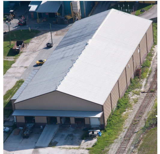
Buidling 735 Roof Replacement