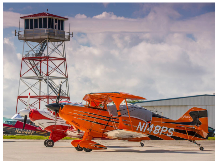
2023 International Aerobatic Club Contest